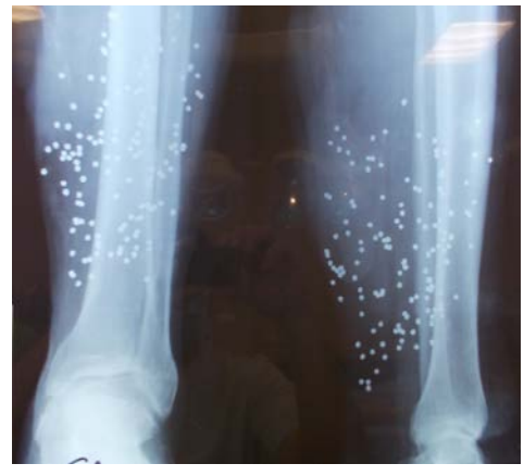
Fig. 2 – X-ray of the left lower leg, with a great number of foreign bodies after a gunshot injury.

A 52-year-old male patient presented with a large fungoid soft tissue mass on the posteromedial part of the left lower leg. The tumor was located at the middle and distal 1/3of the lower leg, measuring 14 \times 12 cm (Figure 1). The patient had a gunshot injury at the same site 22 years earlier, and the wound healed by secondary intention. The growth of the tumor was slow, accompanied by bleeding and infection. The pain was of medium intensity. There was no distal neurovascular deficit. Inguinal nodes were not enlarged. Radiography showed a great number of metal foreign bodies with no bone damage (Figure 2). Pseudomonas aeruginosa was isolated, and the patient was treated with amikacin. In general anesthesia, a wide tumor excision was performed, using margins of 3 cm. Underlying deep fascia was included. The defect was closed by a split-thickness skin graft from the opposite thigh (Figure 3). Histological analysis showed welldifferentiated invasive SCC, with histological grade I and nuclear grade I (Figure 4). There were no tumor elements at the edges of the resection, and no tumor cells were found in excised muscle samples. No distant metastases were found either on additional examinations. The skin graft was well